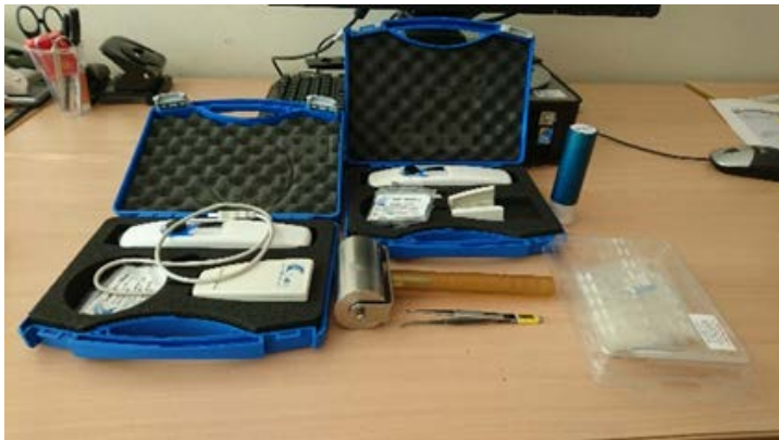
The Vaporimeter, Moisturemeter and tools used for tape stripping.

After receiving hands-on training on the use of Vaporimeter and Tewameter Courage-Khazaka I now know how to measure the TEWL. I learned to measure moisture by means of the Moisturemeter, how to properly perform the tape stripping technique and how to measure optical density of the tape discs using a ScuameScan device. I learned how to place the samples in the special containers and how they are stored, shipped and processed in.