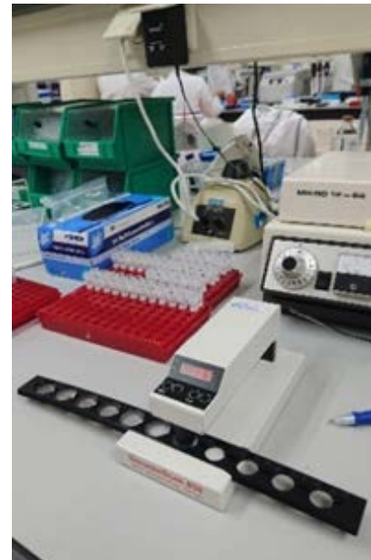
Analysis performed with the ScuameScan 850

By visiting the laboratory I experienced how the samples are processed and how the final results are obtained.