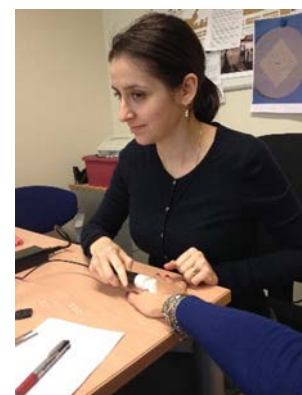
Analysing TEWL with the Tewameter Courage-Khazaka