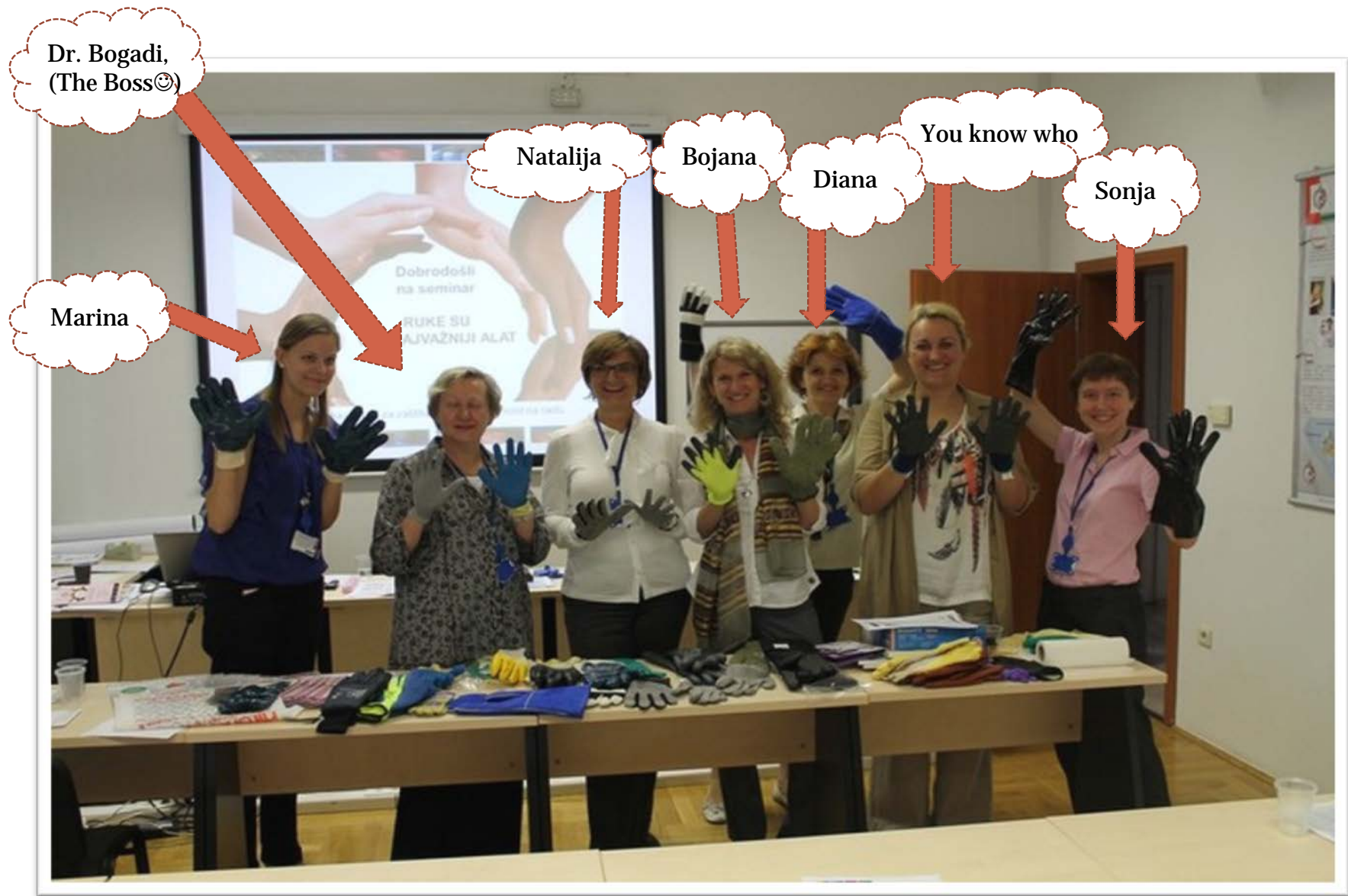
Greetings from Zagreb!